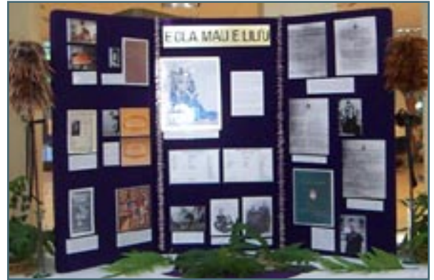
"The Legacy of Our Queen" Exhibit

The exhibit was a collaboration of Hui Hānai – an auxiliary of the Queen Lili`uokalani Children's Center – and ALU LIKE's Native Hawaiian Library.