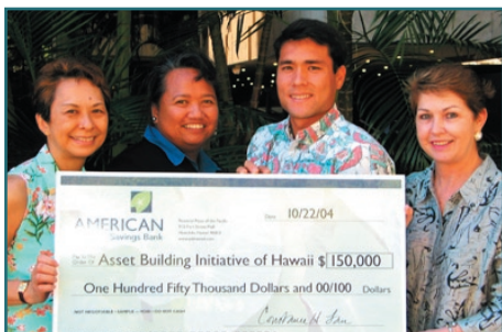
American Savings Bank awards check.