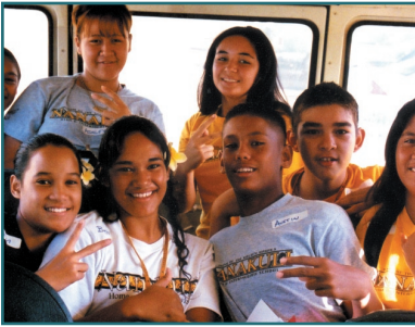
Students have fun while learning.