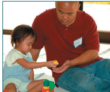
Father plays and educates using colors.